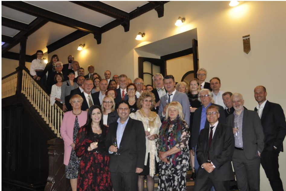
Group photo at the House of Blackheads

The European Council of Civil Engineers would like to express its gratitude to the Estonian Association of Civil Engineers for the successful organization of 67 th ECCE General Meeting and the International Conference “Civil Engineering and Cultural Heritage” as well as for their exceptional hospitality.