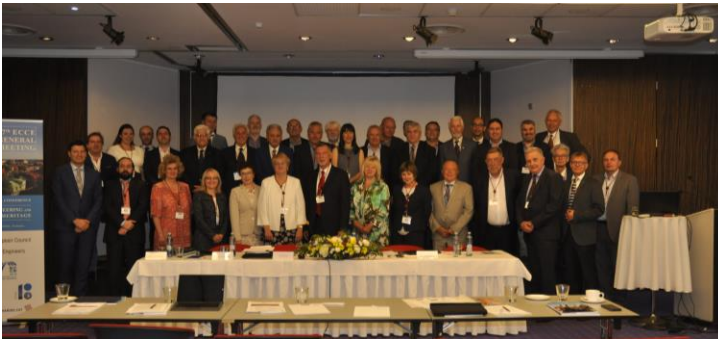
67 th ECCE General Meeting group photo

under the umbrella of the ECCE Initiative “2018 European Year of Civil Engineers” .